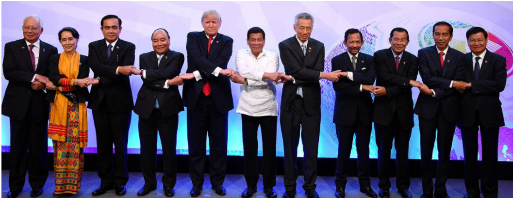
US Embassy in Laos

If the Indo-Pacific is indeed the theatre of the 'new great game', then Southeast and East Asia are at the heart of it. Gloomy forewarnings regarding a perceived lack of trust in the US as a Pacific power, coupled with apparently inconsistent economic policies of Washington amongst countries in the region, have been closely followed by calls for an Asia Pivot 2.0 by Joe Biden, should he win the presidency. The reality is different, though. From a geopolitical standpoint, the Trump administration has contributed constructively to the policy approaches geared towards the preservation of regional stability and the encouragement of alliances.