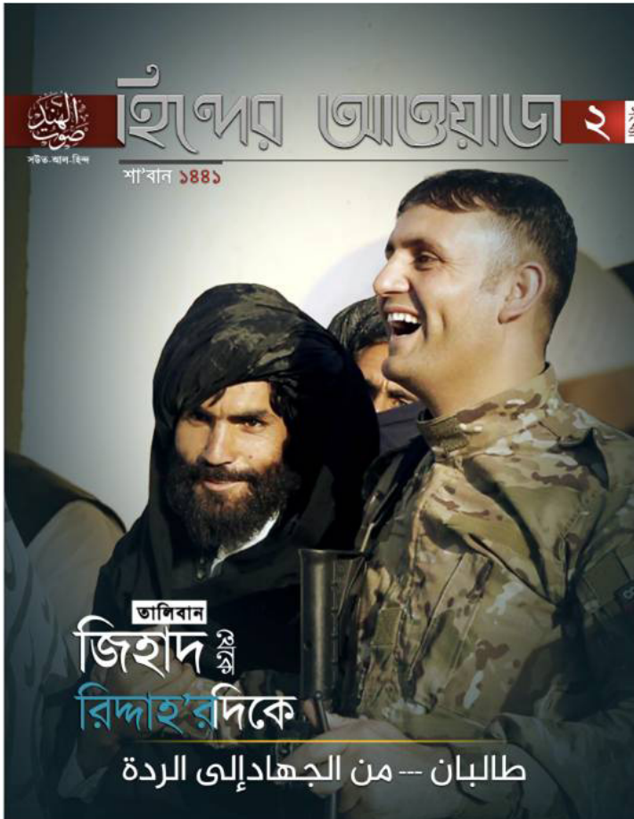
Fig. 2: Cover of a Sawt-al-Hind issue translated into Bengali 42

parties have often sparred over the presence of the group and its influence in the country. 40 Scholar Saimun Parvez highlights that Bangladesh faces significant security gaps by not offering clear information and intelligence on the roots of ISIS in the country, this being played on by local political parties for domestic gains as well. In August 2019, following the arrest of pro-ISIS youths in the capital Dhaka, ISIS' Amaq News released another video in which Bengali ISIS members threatened to conduct attacks in the country on foreigners, politicians and minorities. 41