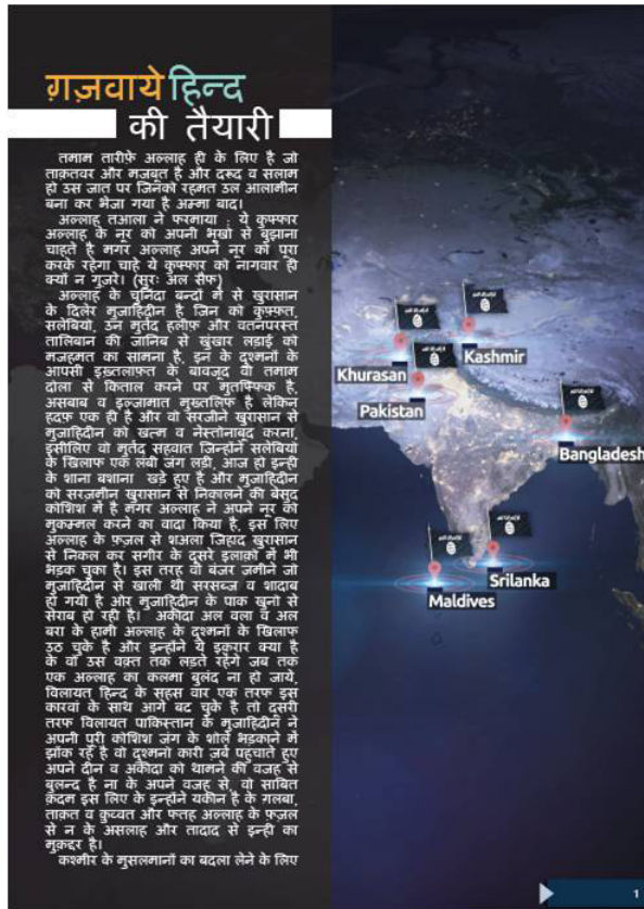
Fig. 1: An example of a Hindi translation of a Sawt-al-Hind issue 31

Issue Number 7 (released in August 2020) of Sawt-al-Hind had an interesting construct of ISIS’ vision of being a “global entity” while also maintaining a strong regional outreach. The front page of the issue shows an ISIS fighter, holding the IS flag, standing on a road leading to Babri Masjid (Mosque) in Ayodhya, India, where a long-standing dispute between the Indian Hindu and Muslim communities over the mosque and an erstwhile historic temple on the same piece of land was brought to a conclusion by the Supreme Court. 32 That judicial decision allowed the Hindus to re-build a temple at the site of the mosque which was demolished by rioters in 1992.