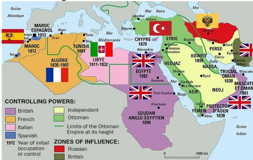
Figure 1: External Powers in the Middle East