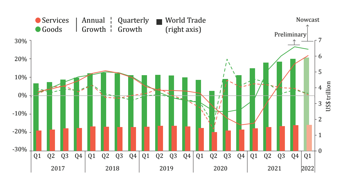
FIGURE 2: Global trade grows after pandemic but is likely to slow down in 2022

oil-reliant export bases went through drastic declines in both merchandise exports and imports during the 2020 pandemic-induced recession. These regions are yet to come out of those shortfalls. South America's comparatively better import recovery is partly the result of a low base effect, as some key economies were already in recession during 2019.<sup>3</sup>