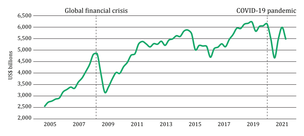
FIGURE 1: Global trade looks more resilient during the COVID-19 pandemic than during the 2008-09 global financial crisis

Total trade volume—in both merchandise and services trades—shows a more resilient recovery in 2021, compared to the period after the 2008-09 global financial crisis (see Figure 1). The recovery is driven primarily by merchandise trade, as trade in services continues to remain depressed.