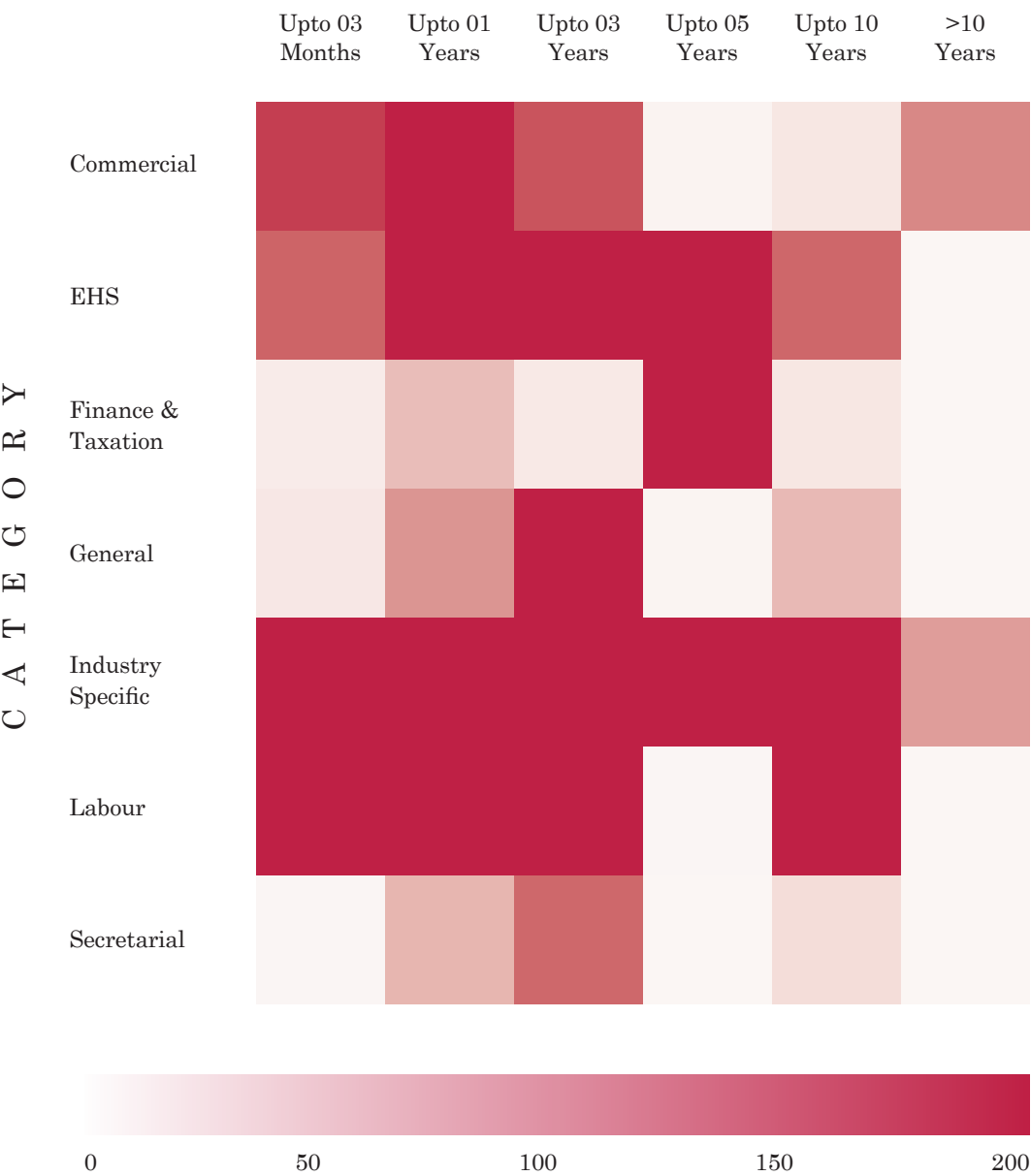
ILLUSTRATION 1: HEAT MAP OF IMPRISONMENT CLAUSES BY CATEGORIES